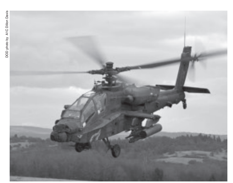
A US Army AH-64 Apache helicopter takes off during combat search and rescue training in Germany.